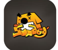
Sumdog Free (iOS) Free (Google)